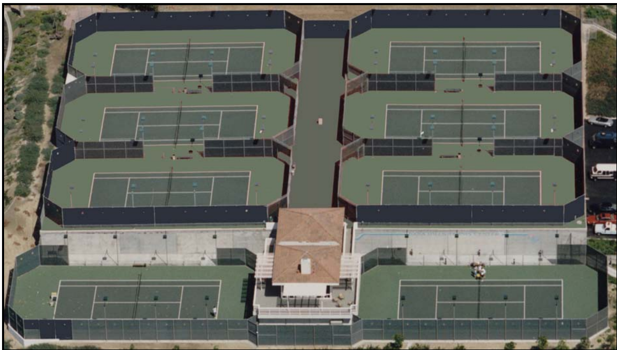
Ariel View of Dana Hills Tennis Center

7:30 a.m. - 9:30 p.m. Monday - Thursday / 7:30 a.m. - 7:00 p.m. Friday 7:30 a.m. - 6:00 p.m. Saturday and Sunday